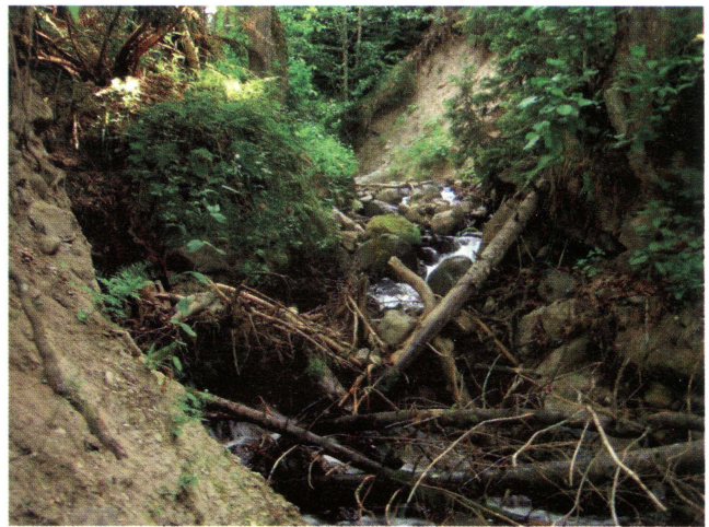
Fig. 5 Type locality of Helix goderdziana sp. nov. habitat

Ecology The macrohabitat is a montane spruce forest (dominant tree Picea orientalis ), on the southern slopes of the Meskheti Mountain Range and the north-eastern slopes of the Shavsheti Mountain Range. It is a humid area, with the annual precipitation of ca 1200-1400 mm (Vladimirov et al. , 1991). The microhabitat is a very damp vicinity of small montane brooks, mostly surrounded by alder trees ( Alnus barbata ), with logs and liverworts on the margins of the brooks (Fig.5). The snail is found in habitats different from those of Helix buchi : the latter species is found exclusively in broadleaf, mostly beach forests, away from streams or brooks (Skarlato & Starobogatov, 1984).