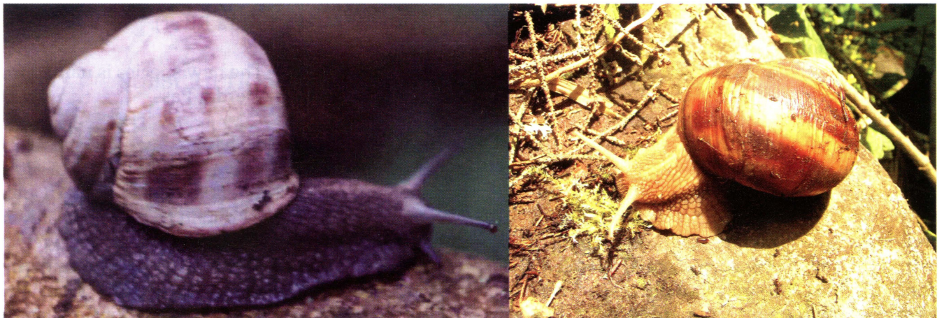
Fig. 3 Left – live Helix buchi , right – live Helix goderdziana sp. nov. (paratype n0009)