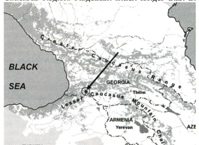
Fig. 1 Map showing the type locality of Helix goderdziana sp. nov.

Diagnosis Shell larger than in any other species of the genus Helix , somewhat similar to that of Helix buchi from which it differs in a taller shell (61 mm compared to at most 54 mm in H. buchi ; Likharev & Rammelmeier, 1952) and light yellowish-brown foot (dark grey to almost black in H. buchi ). Digitiform glands shorter than any other Helix from the Caucasus Region. Flagellum much longer than in