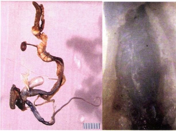
Fig. 4 Helix goderdziana sp. nov. genitalia (paratype n0009): left - full view, right - penial papilla.

H. buchi . Penial papilla larger than in H. buchi , spindle-shaped (for reproductive organs of H. buchi and other Helix species see Schileyko 1978).